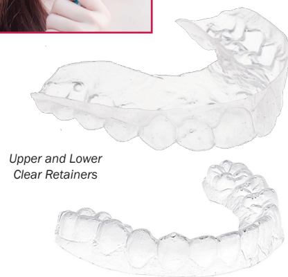
Upper and Lower Clear Retainers

If the retainer is lost or broken there will be a replacement or repair charge.