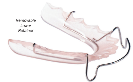
Removable Lower Retainer

Chew lots of sugarless gum for a week after your braces are removed. Close your back teeth, then squeeze tightly. Relax. Repeat this process over and over. It will help your teeth settle and fit together. Proper use of your retainer is essential to establish a stable tooth relationship and keep your smile looking beautiful. The aforementioned Wear and Care instructions will help you maintain your new smile.