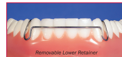
Removable Lower Retainer